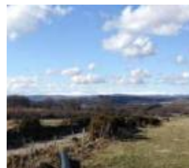
Views to the West

Turn right on to Contlaw Road and cross the bridge over the AWPR, then stay on the road going straight ahead. There are great views out to the west on this next section; you can see as far as Lochnagar on a clear day. Just after a right-hand bend, there is a T-junction, where you go straight ahead on a private road signposted “South Last” and “Contlaw Mains”. There is also a sign on a telegraph pole saying “Footpath to Blacktop”.