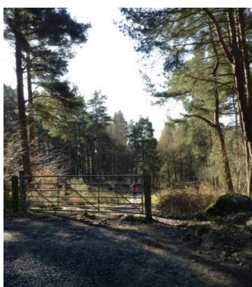
Gate at starting point

Start from a wide gateway on Blacktop Road, just east of a house called East Silverburn and about 300 metres east of where it goes under the AWPR. Go through the gate and follow the unsurfaced track through woodland with tall trees. The track gradually narrows to a footpath. When you come to a section of the path with rustic wooden fencing on either side, turn right on to a path signposted “Core path to Contlaw”. This next section through trees is likely to be muddy.